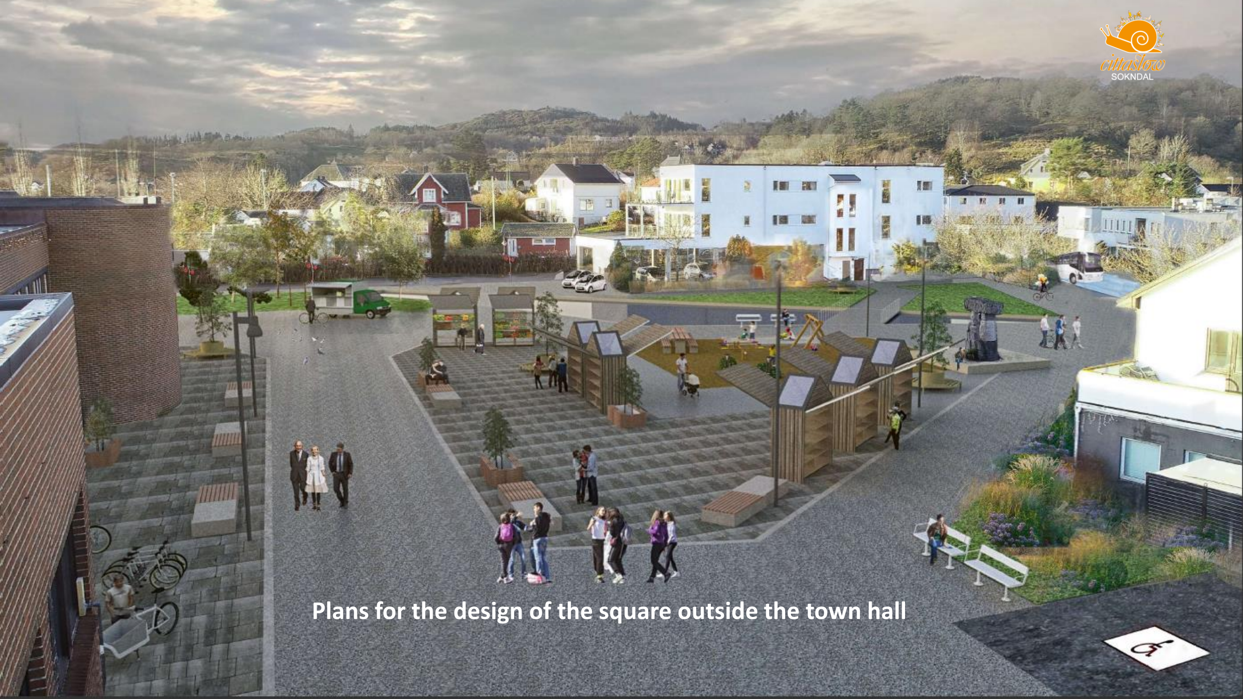
Plans for the design of the square outside the town hall