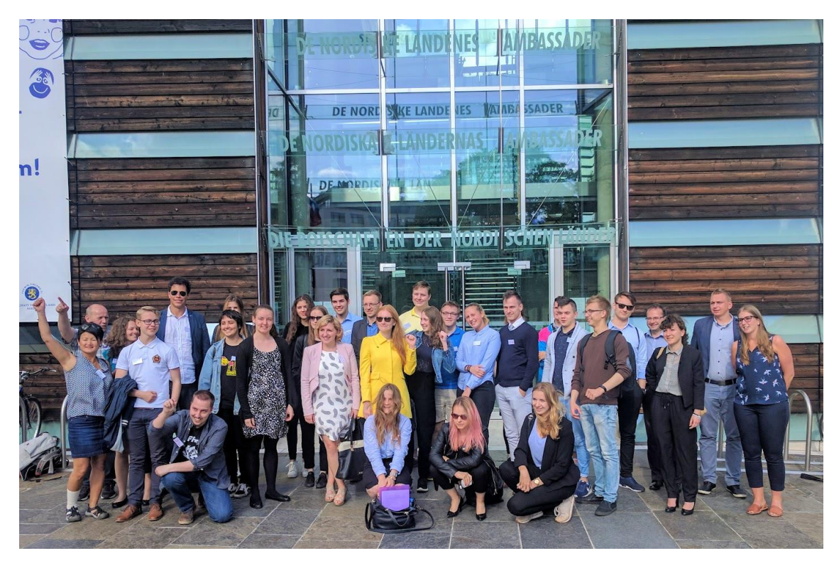
Federal Foreign Office in Berlin, and followed three steps to facilitate the dialogue and networking among the youth.

The first part was the exchange of knowledge and opinions which took place on Monday, 12th June when all the youth met in the Nordic Embassies for an informal working lunch and the first working session. Good practices in the youth fields have been presented by representatives of the three organisations; afterwards, young participants were invited to reflect and discuss upon different topics and manners to facilitate the access of youth to the political discussions of their countries, giving them voice and possibility to influence their future.