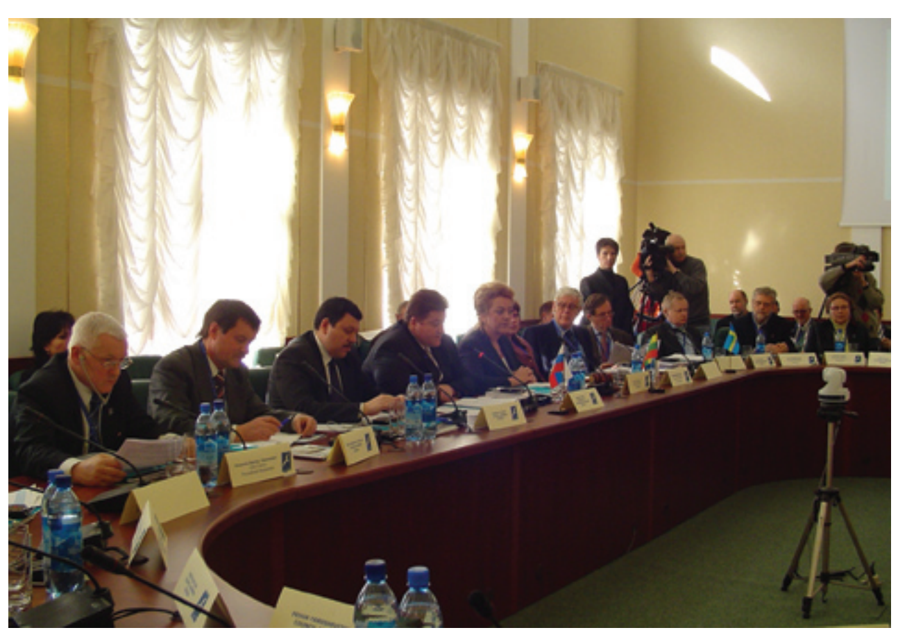
ERB Council meeting in Kaliningrad on 30th March 2006, opening the Presidency of the Russian Party.