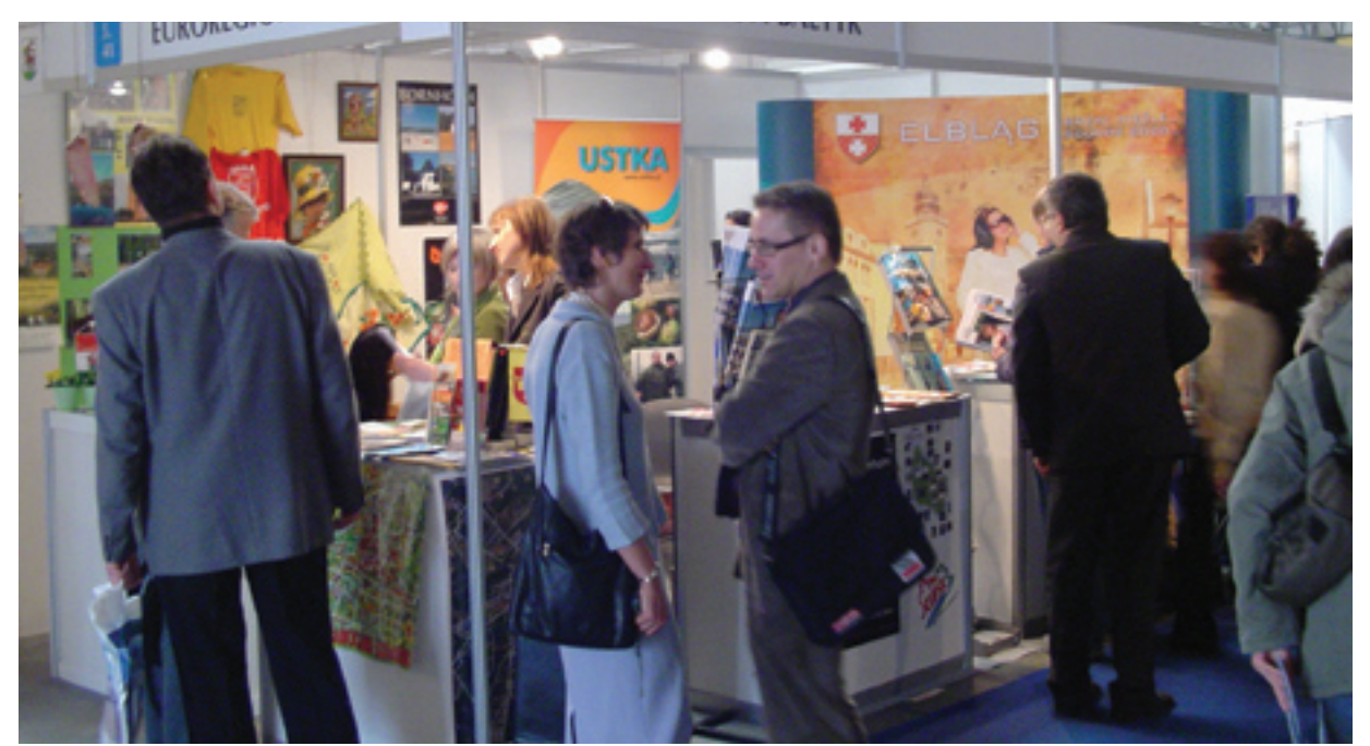
Euroregion Baltic stand at the Tourism Fair in Gdańsk, 7 - 9 April 2006.

The meeting was attended by the representatives of the ERB member regions, Local Tourism Organisations from Bornholm, Iława, Olsztyn, Szczytno, Wejherowo and Tourism Development Agency of Pomorskie Region