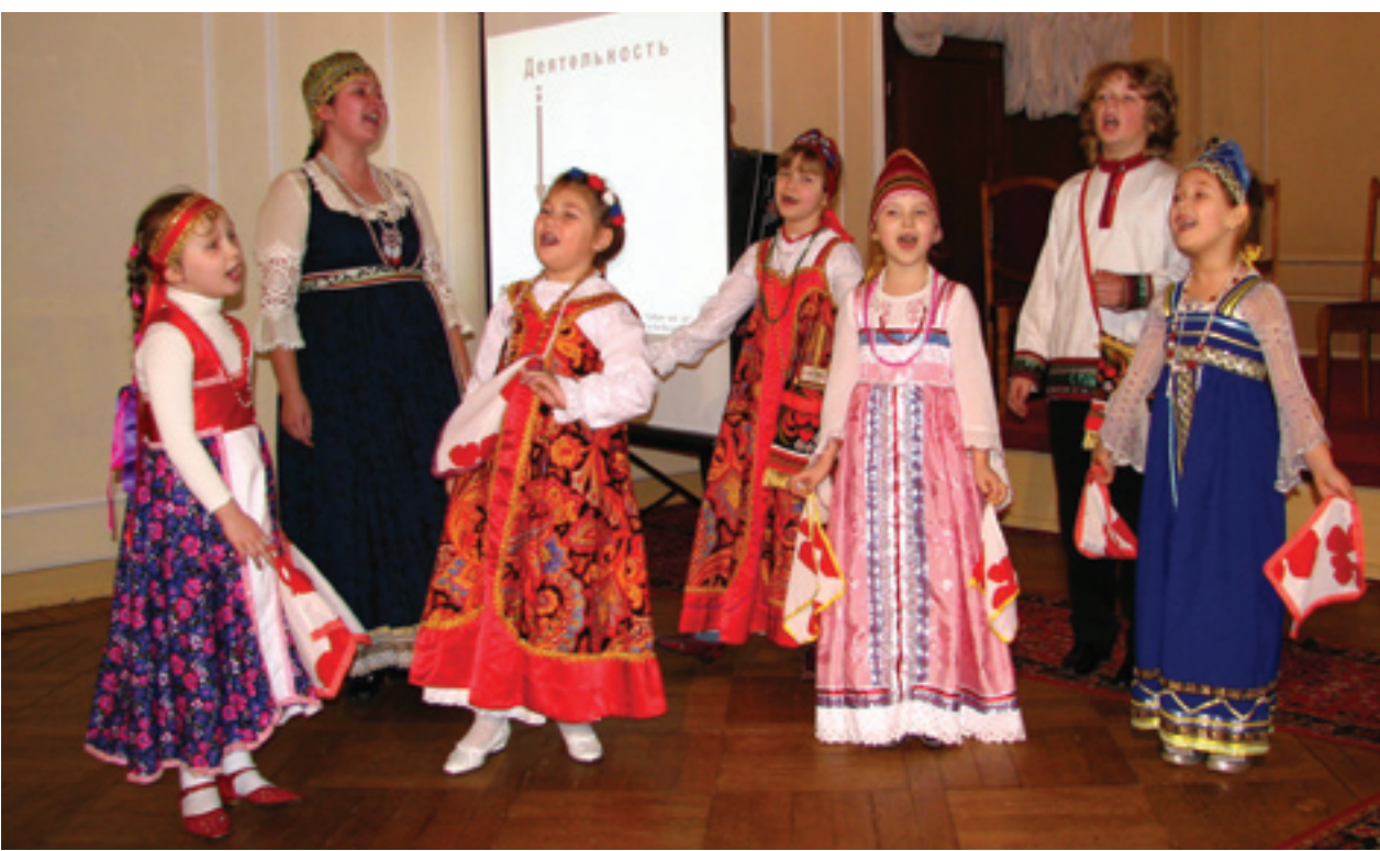
The dancing group of children from the Kaliningrad Region during the entertainment part of the culture eductaion workshop.

The main objective of the project is to establish a new network of cooperation of Kaliningrad region and neighbouring territories in Poland, in the sphere of culture. The Project activity is united into three main blocks "System of additional professional education", "Effective communication", and "Strategy of development". The result of the first block aiming to raise education and level of competence of workers of culture and art of neighbouring territories in the sphere of management, is introducing the pilot course of raising professional qualification "Management of culture". The result of the second block is to build up the system of information exchange and professional communication of workers and organisations of culture and art of neighbouring territories. This block consists of a virtual platform (Internet portal on 3 languages: Russian, Polish, and English) and a platform for "life" communication. In order to coordinate and further develop this activity it is planned to create a Council of professionals of culture and art. The third block will result in elaborating the strategy of cross-border cooperation in the sphere of culture and art within the next 5 years.