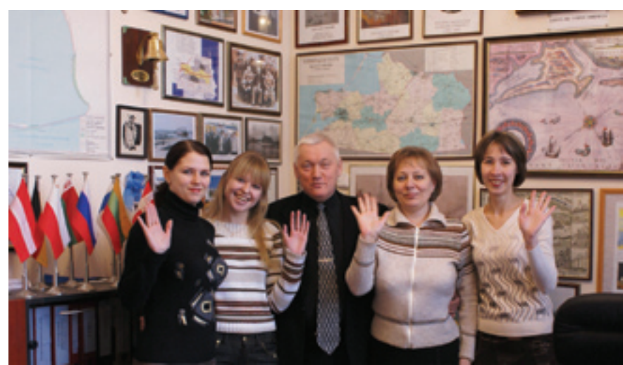
Employees of the Russian Secretariat of Euroregion Baltic in Baltijsk