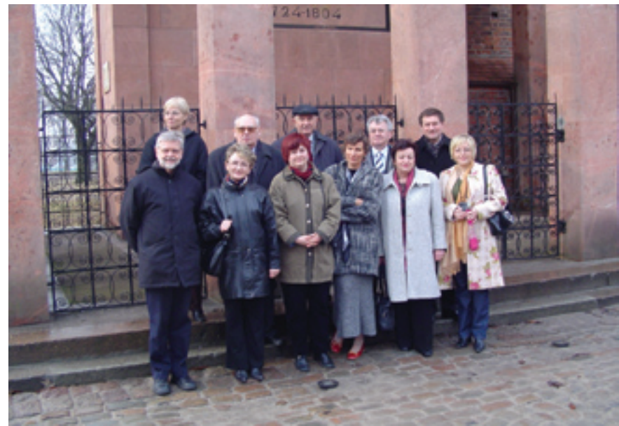
Members of the Polish, Russian and Swedish delegation to the Council meeting in Kaliningrad on 30th March 2006 in front of Immanuel Kant's tomb outside the Kaliningrad Cathedral