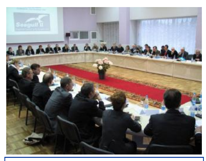
The order crossing conference was attended by 70 national, regional and local representatives from Euroregion Baltic.