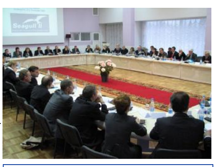
The border crossing conference was attended by more than 70 representatives of the national, regional and local level from around the Euroregion Baltic

For this reason, as part of the Seagull 2 project we are now managing a series of two conferences entitled: Poland and Lithuania's accession to the Schengen Treaty: consequences and perspectives for the crossborder cooperation between the Kaliningrad Region and its neighbours , whereby we are seeking practical solutions to define possible ways of continuing the cooperation in the Euroregion in the context of the enlarged Schengen Treaty and to contribute to the prevention from new divisions on the UE's external borders. The first conference took place in Svetlogorsk in the Kaliningrad Region, attended by over 70 regional politicians, representatives of foreign ministries and parliaments of Lithuania, Poland of Russia, as well as of the Consulates of Denmark, Lithuania, Latvia, Germany, Poland and Sweden residing in the Oblast, and the border service people from Lithuania, Poland and Russia.