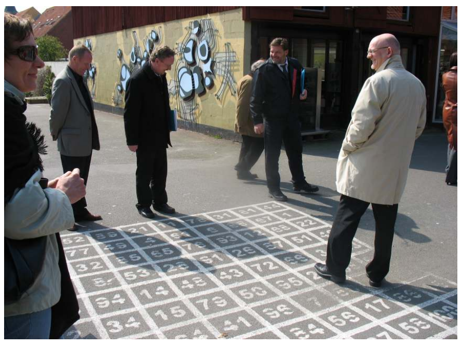
While an EU Baltic Sea Strategy still remains somewhat of a puzzle ERB Board members are looking into the future with confidence.