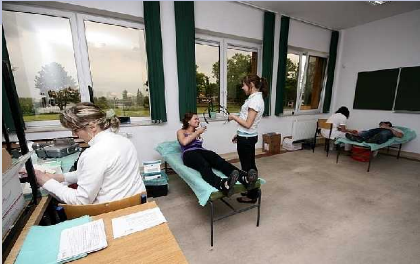
Wampiriada 2009 – giving blood by students