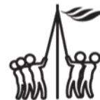
Cooperation capacity building