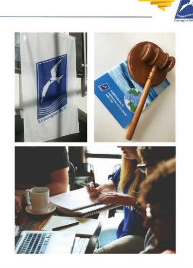
2004 INTERNATIONAL PERMANENT SECRETABIAT On 1st July 2004 ERB established a joint secretariat – the International Permanent Secretariat, in Elblag, At the same time ERB membership fee was introduced, and regular online meetings between the ERB secretariats introduced (MS Messenger).

Continue cooperation with the European Commission DG REGIO unit D2: Interreg, Cross-Border Cooperation, Internal Borders representatives;