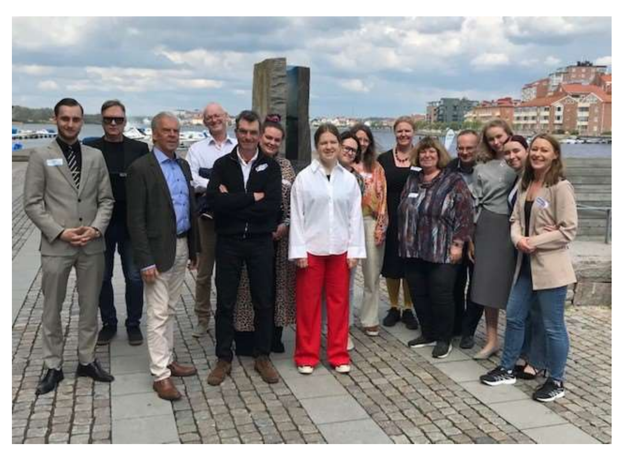
From ERB Board meeting in Karlskrona 15<sup>th</sup> May 2023